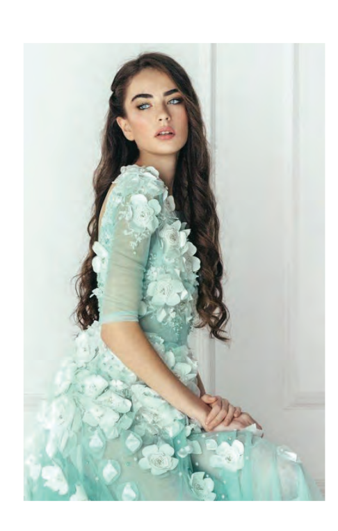
12. PISCES (February 19 - March 20)