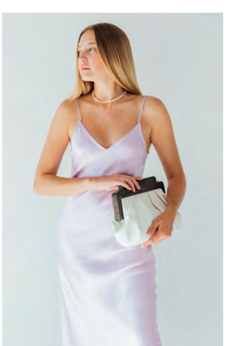
4. CANCER (June 21 - July 22)