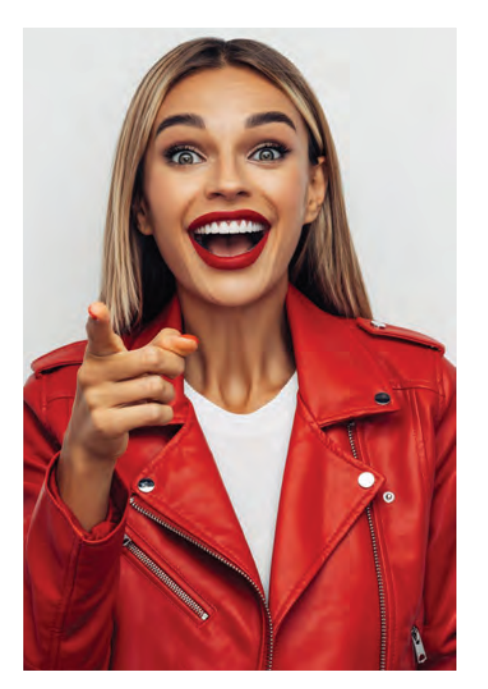
1. ARIES (March 21 - April 19)

Fashion and the Zodiac Signs are often linked in astrology, where different signs are thought to have a style that reflects their personality traits. It is always fun, and perhaps also informative, to pair your fashion choices with your zodiac sign. Perhaps this pairing can also give you helpful hints in developing your fashion style?