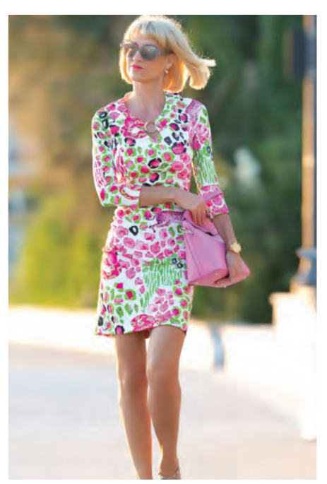
3. GEMINI (May 21 - June 20)