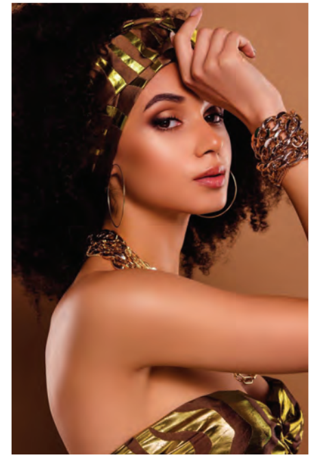
5. LEO (July 23 - August 22)