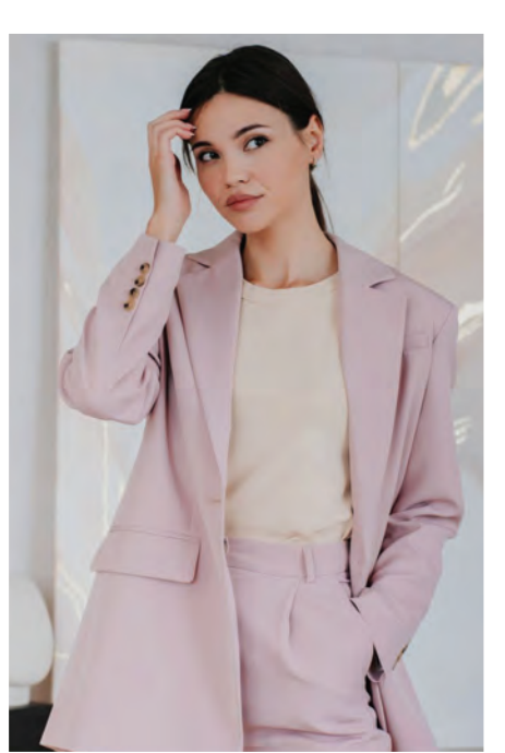
7. LIBRA (September 23 - October 22)