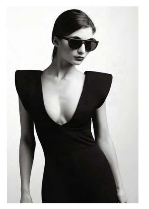
8. SCORPIO (October 23 - November 21)

Libras appreciate harmony, so their style is elegant, sophisticated, and always well-coordinated. They opt for pieces that have timeless appeal - think tailored blazers, flattering silhouettes, and soft, harmonious colors like pastels or soft metallics.